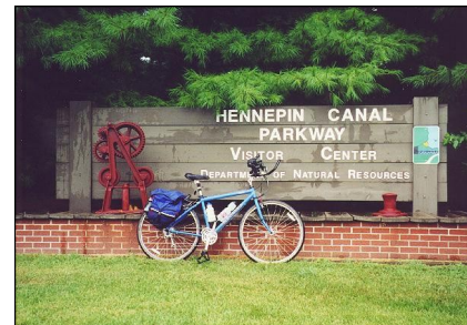
Visitor Center in Sheffield, IL

For more details, or to donate, go to: www.friends-hennepin-canal.org